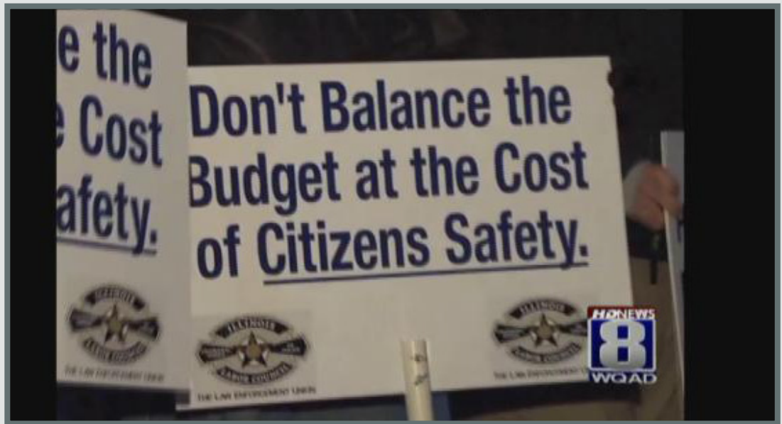
Fraternal Order of Police members and other county citizens hold a successful rally on November 8, 2011, prior to the Henry County Board of Directors' meeting in which a proposal to eliminate five law enforcement positions is discussed.