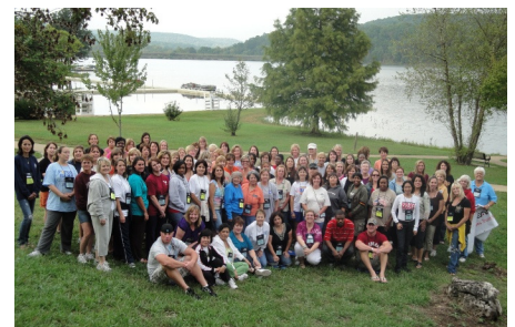
Spouses' Retreat— 90 Survivors