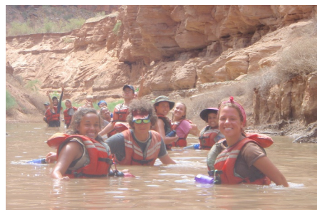
Outward Bound®- 42 Survivors