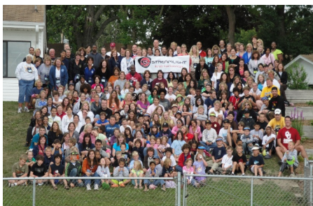
C.O.P.S. Kids Camp— 206 Survivors

C.O.P.S. finishes Hands-On Programs for 2009. All totaled 649 surviving spouses, parents, siblings, children, and in-laws attended the weekend grief retreats. The costs for Hands-On Programs for 2009 will exceed $450,000.